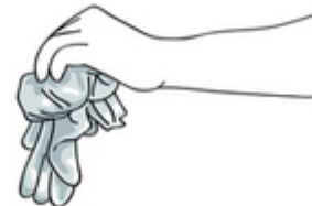
3. Discard the removed gloves

4. Then, perform hand hygiene by rubbing with an alcohol-based handrub or by washing with soap and water.