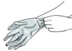
3. Don the first glove