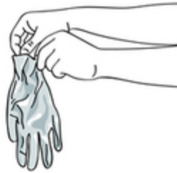
2. Touch only a restricted surface of the glove corresponding to the wrist (at the top edge of the cuff)