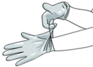
5. To avoid touching the skin of the forearm with the gloved hand, turn the external surface of the glove to be donned on the folded fingers of the gloved hand, thus permitting to glove the second hand