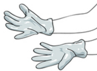
6. Once gloved, hands should not touch anything else that is not defined by indications and conditions for glove use