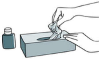
1. Take out a glove from its original box